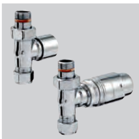
Valves: see page 132