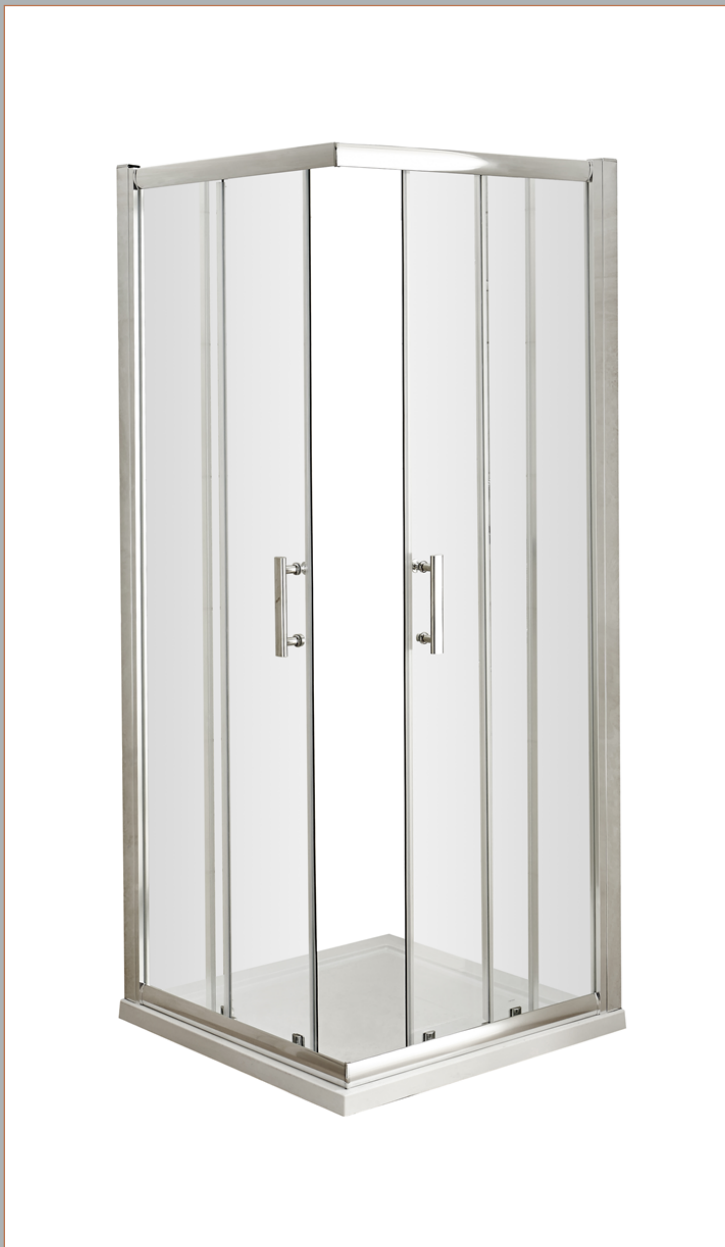
Pacific Corner Entry Enclosure

Description: Aegean Corner Entry Enclosure 760X760mm