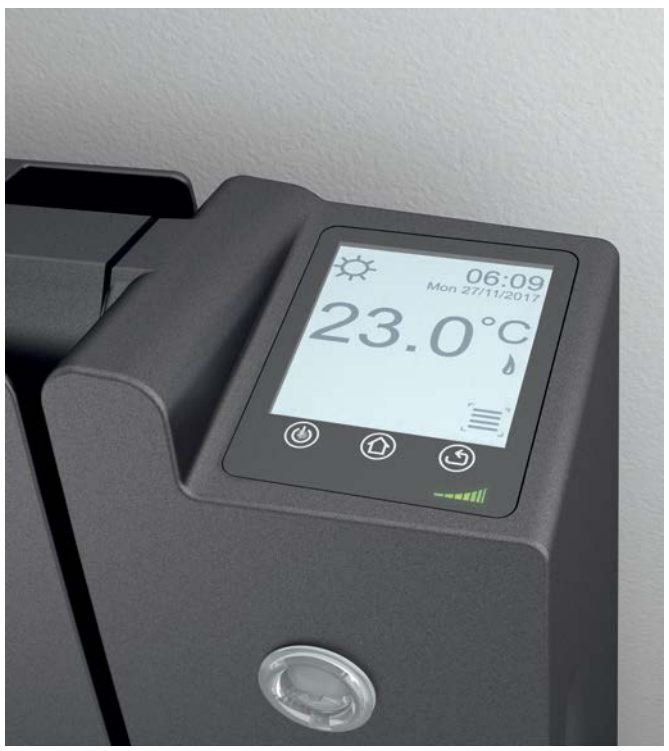
Remote control device with "open-window-detection"