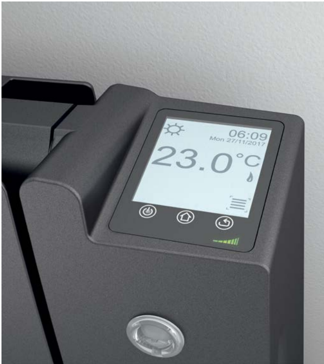
Remote control device with "open-window-detection"

V20180321, RAD_DAS, MASTER_en, subject to change without notice