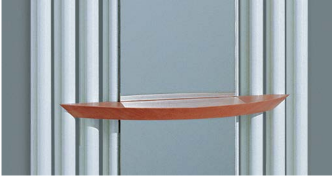
Optional wooden storage option made of solid beech, painted in silk matt