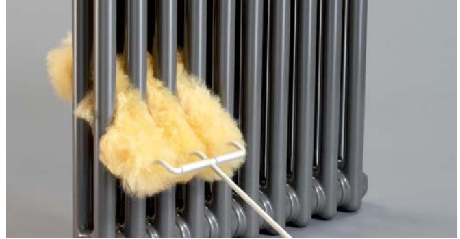
Zehnder lambswool cleaning brush

V20180412, RAD_DAS, MASTER_en, subject to change without notice