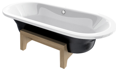
Oval steel bath with platform set in natural american oak wood and optional anti-slip base.