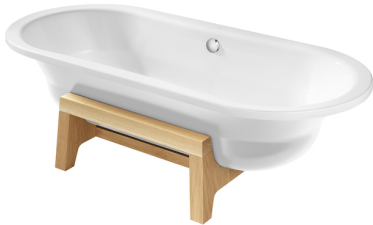
Oval steel bath with platform set in natural american oak wood and optional anti-slip base.