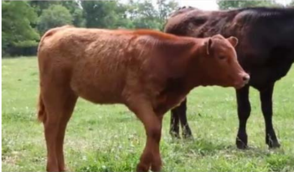
Illustration of a red heifer

One of the most amazing assemblies I ever beheld was an assembly of about 400 Orthodox men and women on a Sabbath. A prominent Rabbi had come to town to speak. He went up to the Bema, the equivalent of a Christian altar, and declared, "Yshua (Jesus) the Messiah is coming and coming quickly." The room was so quiet you could hear a pin drop. He was not dragged off the bema, nor pummeled with rotten fruit. Instead the assembly quietly listened to him and his message that associated the Parah Adumah, Red Heifer, with Messiah.