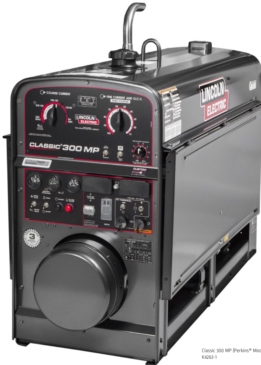
Classic 300 MP (Perkins® Model) K4263-1