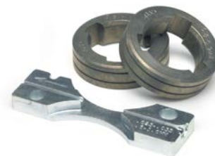
Shown: KP1697-035C, Cored Drive Roll Kit