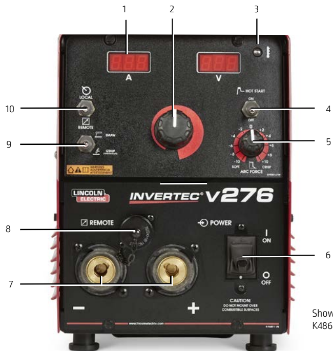
Shown: K4868-2 Invertec® V276