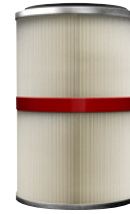
KP5178-3 FILTER, MERV 16, PTFE