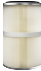
KP5178-2 FILTER, MERV 16, Cellulose/Nano