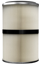
KP5178-1 FILTER, MERV 11, POLYESTER