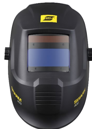
Lightweight, streamlined shell design with 1/1/1/2 CE optical clarity ADF.