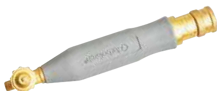
WA-400 Torch Handle Part No. 0386-0410