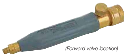
PLF-A5 Proline® Torch Handle Part No. 0386-0872