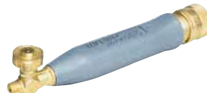
G4 TurboTorch® Torch Handle Part No. 0386-0308