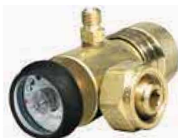
AR-B Regulator Part No. 0386-0725