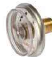
AG-1 Regulator Part No. 0386-1200 (gauge only)