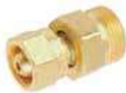
MCT Adapter Part No. 0386-0505