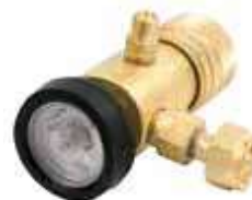
AR-MC Regulator Part No. 0386-0726