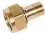
BTMCR Adapter Part No. 0386-0503