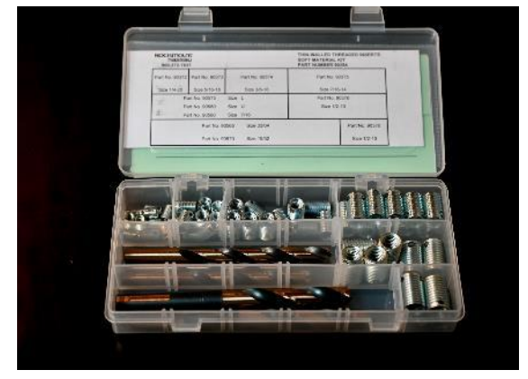
Thin Wall Threaded Insert Kit w/ LaserBest Drill Bits