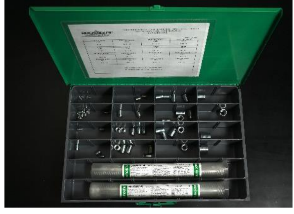
Large Stud Repair Kit w/ Brutus Arc Rod