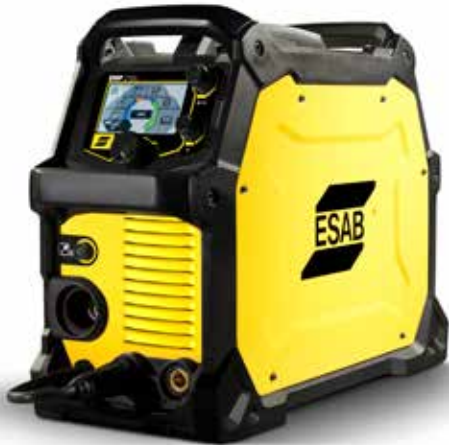
Rebel EMP 215ic