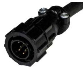
8-pin Amp® connector