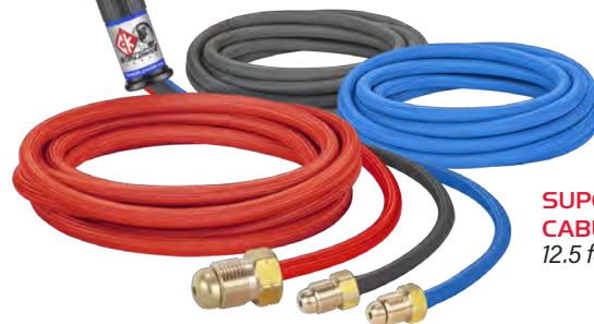
SUPER-FLEX CABLES 12.5 feet (3.8m) long