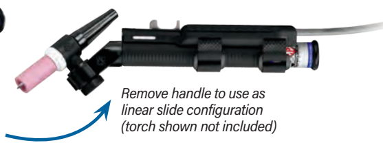
Remove handle to use as linear slide configuration (torch shown not included)