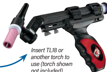
Insert TL18 or another torch to use (torch shown not included)