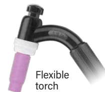
Flexible torch neck for precise positioning

350 amp ACHF or DCSP @ 100% Water-Cooled Length: 8" (20.3cm) Weight: 5 oz. (141gm)