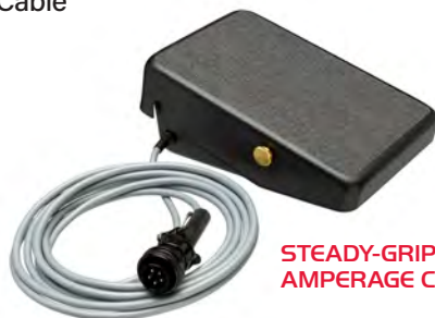
STEADY-GRIP FOOT PEDAL AMPERAGE CONTROL