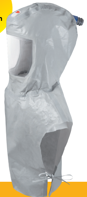
3M™ Versaflo™ Hood S-857

Head, face, neck, and shoulder coverage. Fabric suspension, inner shroud.