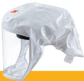
3M™ Versaflo™ Headcover S-133

Head and face coverage. Integrated comfort suspension. General purpose fabric.