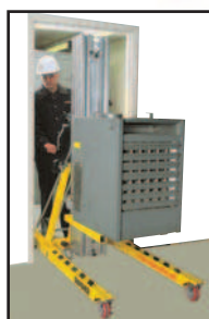
Fits through doorways!

Using plunger pins, forks remove and reverse easily for added height or to get flush with a ceiling. No loose pieces!