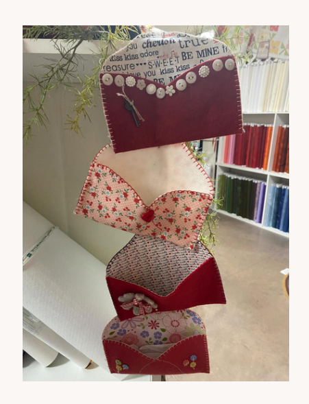
Second, includes our collection of Valentine's Day fabrics! Find more click here.