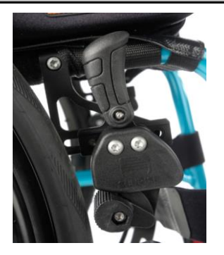
Knee lever wheel lock