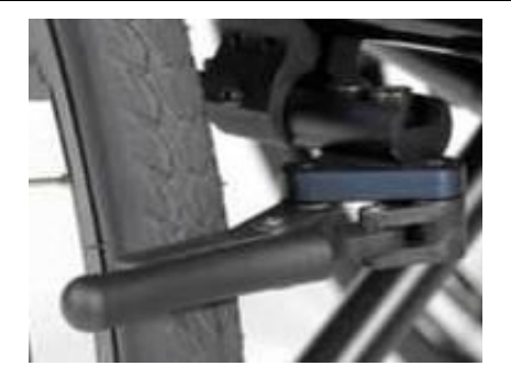
Compact wheel lock