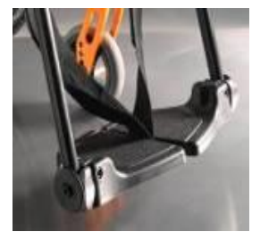
Divided footplate composite