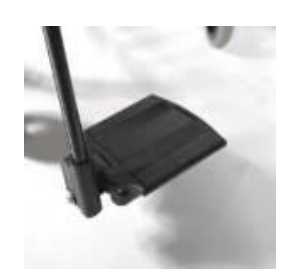
Divided footplate aluminum