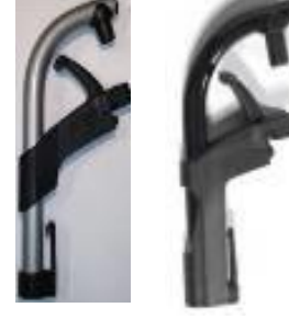
Composite hanger 70°/80°