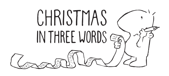
"Describe Christmas in three words."

That was the challenge put to various celebrities in a television advertising campaign a few years ago.