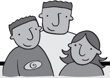
Table Talk helps children and adults explore the Bible together. Each day provides a short family Bible time which, with your own adaptation, could work for ages 4 to 12. It includes optional follow-on material which takes the passage further for older children. There are also suggestions for linking Table Talk with XTB children's notes.