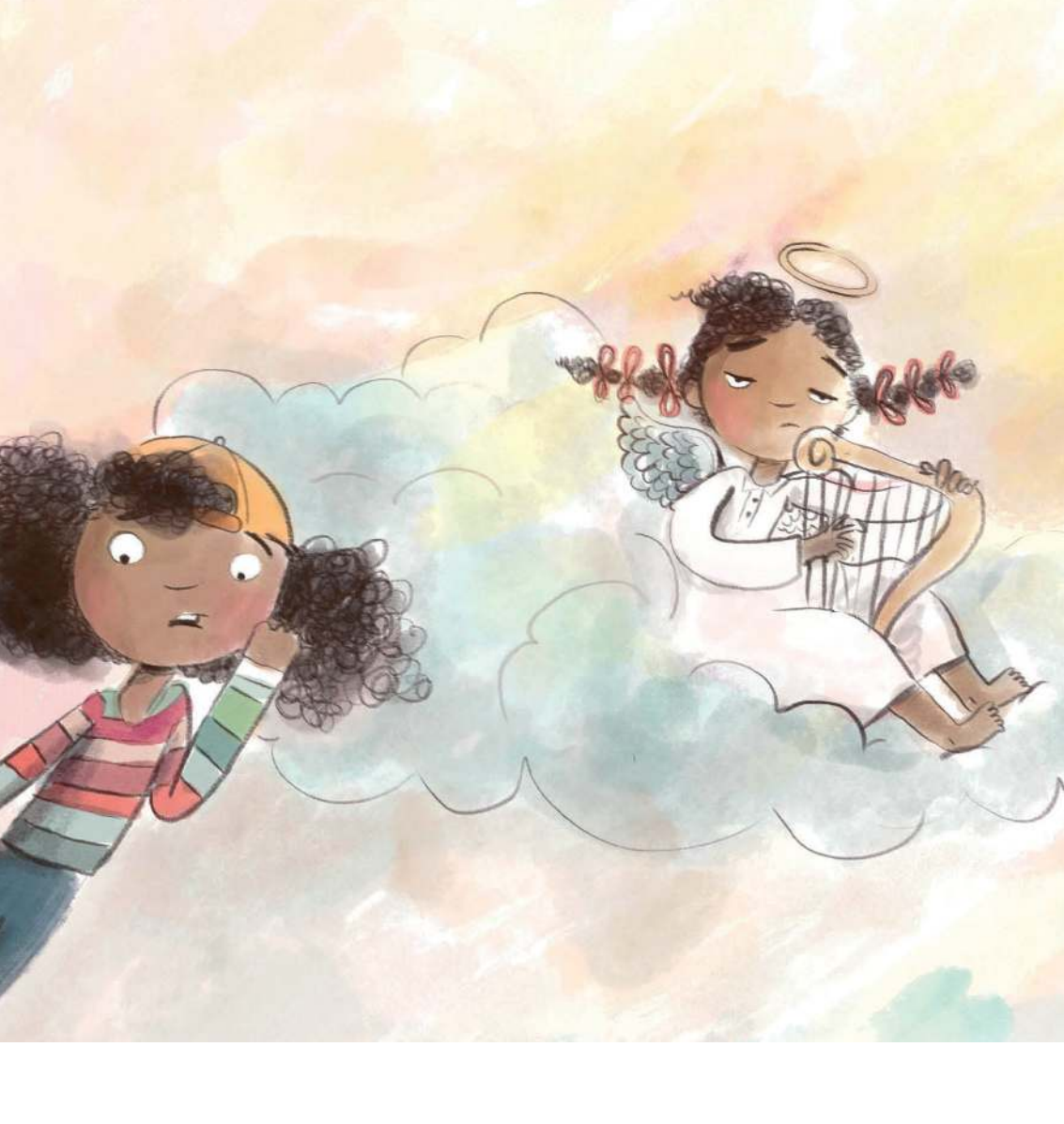
What is heaven like?