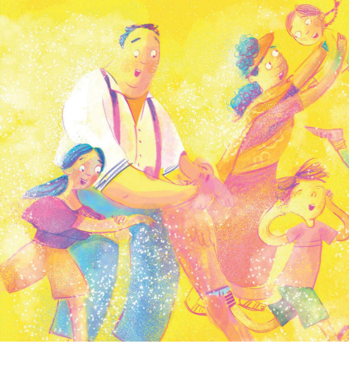
We will have new bodies.