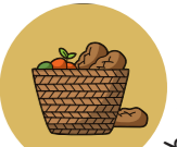
4. Four woven baskets