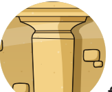
8. Eight tall stone pillars