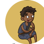
1. One young Jesus