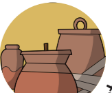
6. Six clay pots