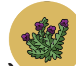
3. Three purple wall flowers