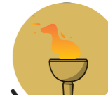
7. Seven burning braziers