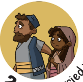
2. Two worried parents