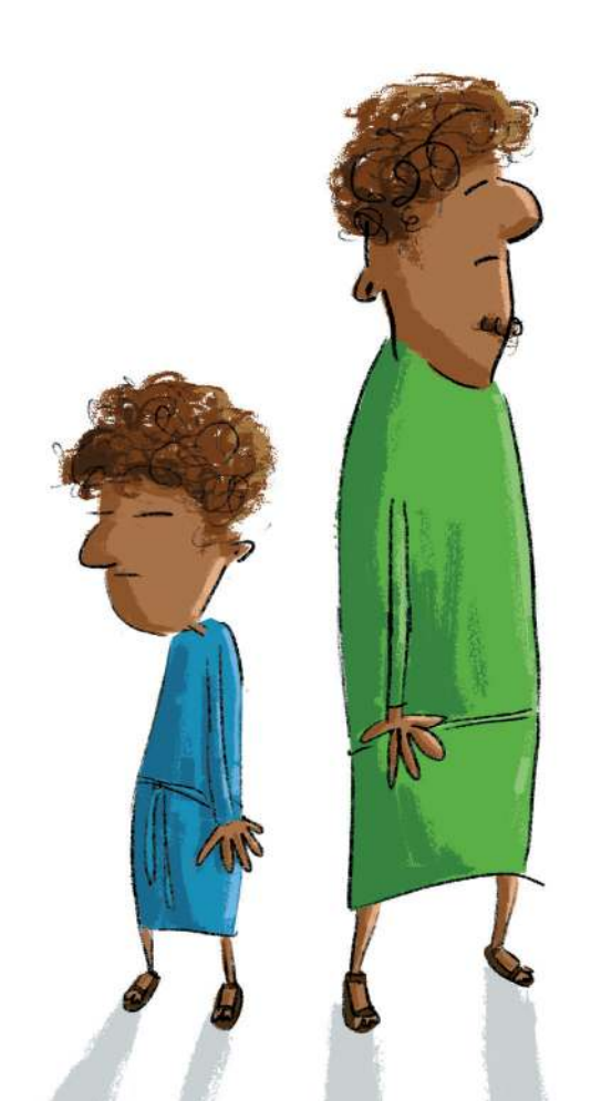
Once there were two brothers.