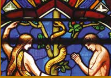
Adam & Eve stained-glass window