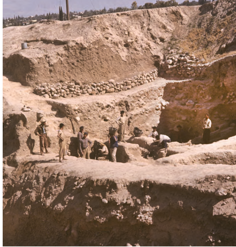
Archaeological study at the ruins of Jericho. ►

Correctly interpreted the historical records of Egypt and Israel show a remarkable consistency with the Bible records, which we can accept as not only inspiring but also entirely reliable.