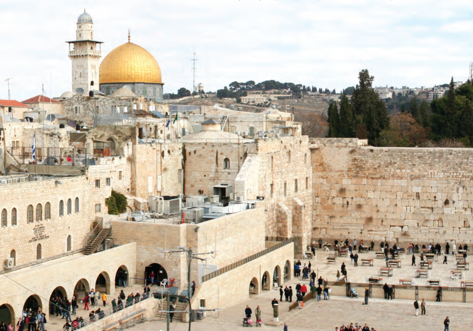
Western Wall in the Old City of Jerusalem, the most important Jewish religious site with al-Aqsa mosque (right) and Dome of the Rock (left) in the background. ▼

Archaeologists who cling to the traditional chronology challenge revisionists with fiddling with the dates, but an examination of the evidence upon which the traditional chronology is based reveals alarming inconsistencies. The traditional dates of Egyptian history have been largely based on the records of an Egyptian priest by the name of Manetho who left a list of dynasties and kings and their