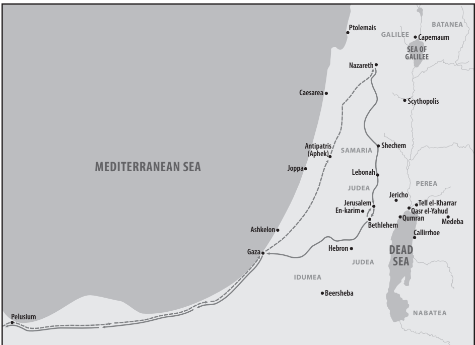
Figure 1. Jesus' journey to Egypt

13 They slipped away . . . Look! The Lord's envoy appears in a dream to Yōsēf [Joseph], saying, "Being raised, take the child and his mother and flee to Aiguptos [Egypt], and be there until I tell you! For Hērōdēs is about to pursue the child to destroy it." 14 The one