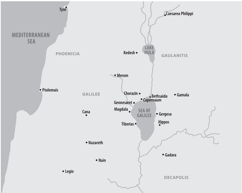
Figure 2. Jesus’ ministry in Galilee

28 It happened: when Yēsous completed these words, the crowds were shocked at his teaching, 29 for he was teaching them as one having authority and not as their Covenant-Code scholars [scribes].