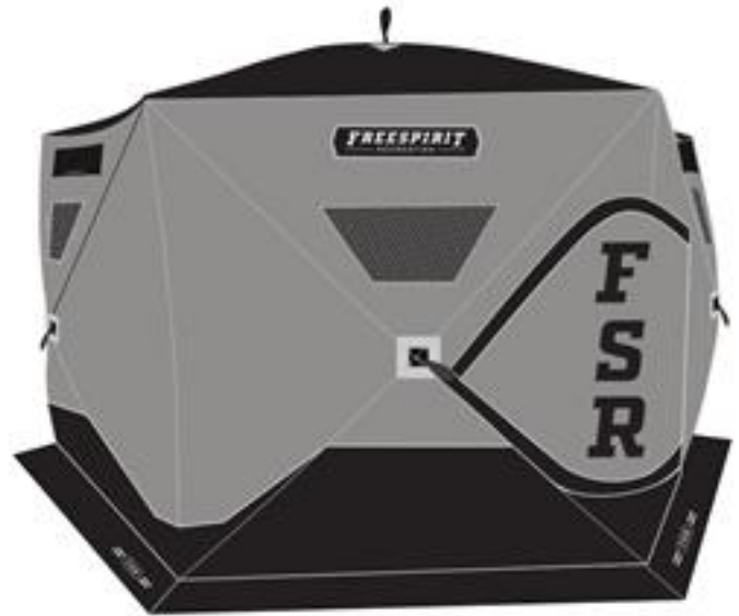
6 HUB TENT