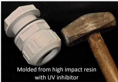
Molded from high impact resin with UV inhibitor

Image to the right shows a roof-top installation using 4 Sigrist Exit Seals® on our "Small" Sigrist Pipe Chase Housing and Curb system.