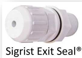
Sigrist Exit Seal®