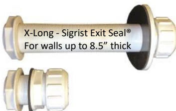
Sigrist Exit Seal® For walls up to .75" thick

DATA CENTER: 18" x 60" x 24" tall housing Curb: 14" tall - 18" tall Curb