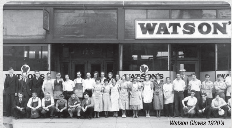
Watson Gloves 1920's