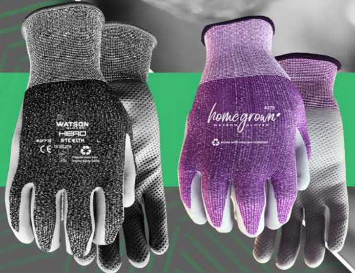
#375 KARMA ♀