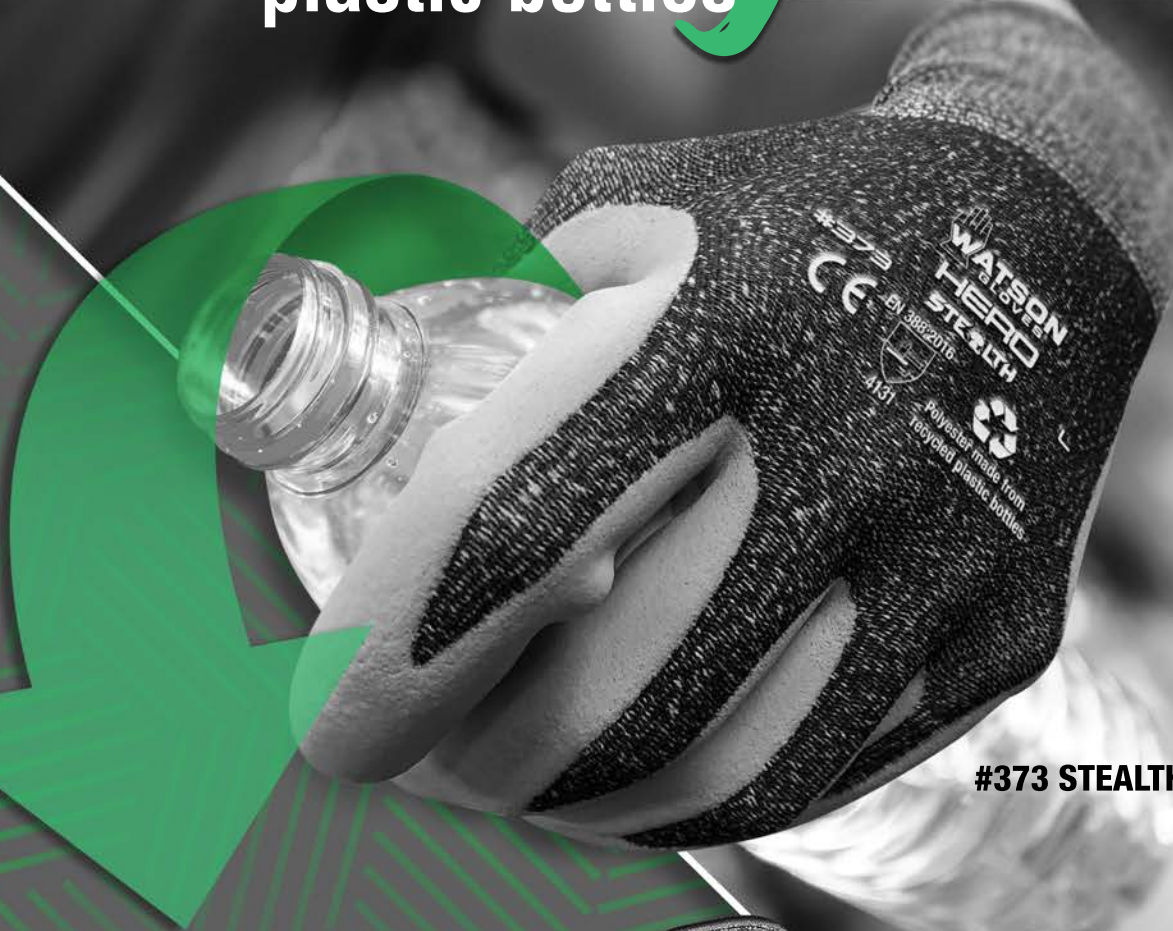
#373 STEALTH HERO