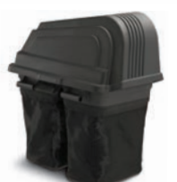
TRACTOR TWIN BAGGERS