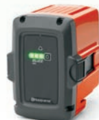
BLi22 4 amp hours