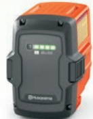
BLi30 7 amp hours