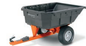
12.5 CU. FT. POLY SWIVEL DUMP CART

Designed to provide commercial customers A VOLUME DISCOUNT OF UP TO 20% on new Husqvarna equipment.