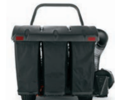
ZERO-TURN TRIPLE BAGGERS