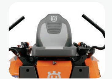
High-back 18" seats