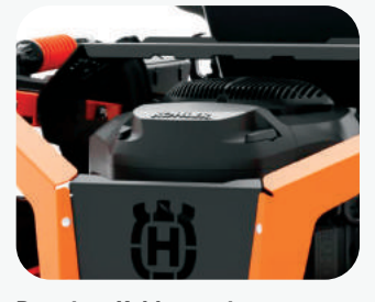
Premium Kohler engines