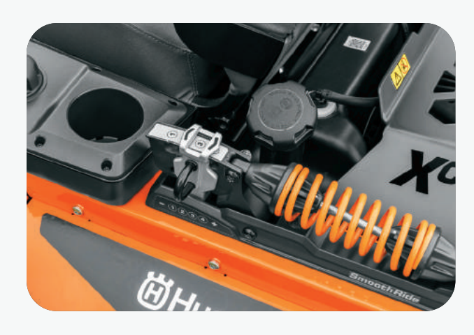
*When compared to other consumer zero-turn mowers. Only mower in its class to feature a 4-bar link suspension system and 10 adjustment settings.

SmoothRide™ system features adjustable springs with 10 comfort settings and a 4-bar link system.