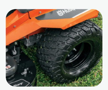
Rugged all-terrain tires