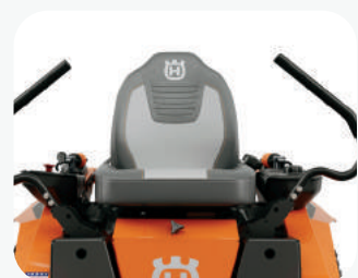
High-back 18" seats