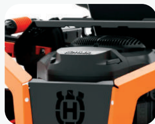
Premium Kohler engines