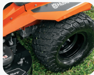
Rugged all-terrain tires