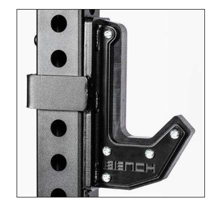
Sandwich j hook with high density plastic to protect barbell