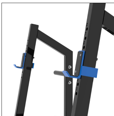
8 position J hook Adjustment