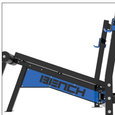
Customizable Logo Plate

The Bench Fitness Revolve range is Built Strong to stand the test of time and fully customizable with a range of colours available.