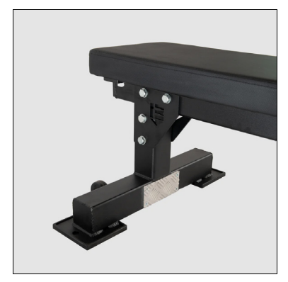
Heavy duty rubber feet