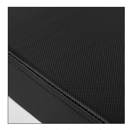
Textured grip material

Our Revolve range offers you a full range of custom colours and logos available upon enquiry. Built Strong as only Bench Fitness can, the Bench Fitness Revolve Flat Bench will take whatever you can throw at it.