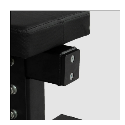
Rear high density plastic to store bench upright