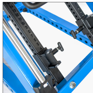
Dual safety stop adjusters