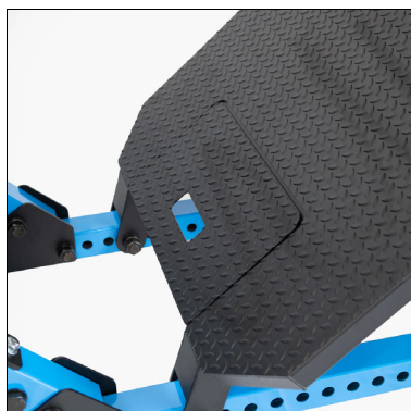
Removeable calf raise foot plate