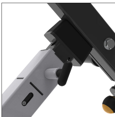
Adjustable seat height