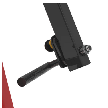
3 position adjustable knurled handles

Elevate your upper body workouts with our Exceed Seated Incline Bench Press. The adjustable seat height, back rest angles and handles allow for a comfortable and customized fit, while the incline design targets your upper chest and shoulders. Built Strong with safety and stability in mind, the Exceed Seated Incline Bench Press also comes with added plate storage making it a great addition to any home gym or commercial fitness facility. At Bench Fitness, we strive to exceed expectations, and our Exceed Plate loaded machines exemplify this philosophy. You can customize the complete range of machines with an extensive range of colors and even add your own branding for a personalized touch. Additionally, all Exceed plate loaded machines are compatible with our REVOLVE band pegs, which can help you take your workouts to the next level.