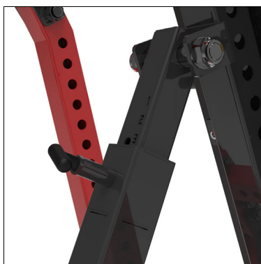
Adjustable back angle position