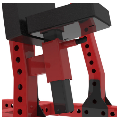
Adjustable back angle

At Bench Fitness, we strive to exceed expectations, and our Exceed Plate loaded machines exemplify this philosophy. You can customize the complete range of machines with an extensive range of colors and even add your own branding for a personalized touch. Additionally, all Exceed plate loaded machines are compatible with our REVOLVE band pegs, which can help you take your workouts to the next level.