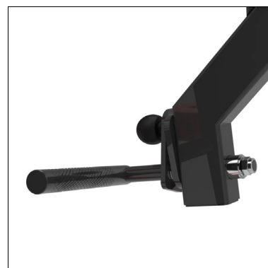
3 position adjustable knurled handles