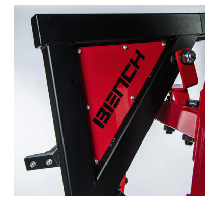
Customizable logo plates