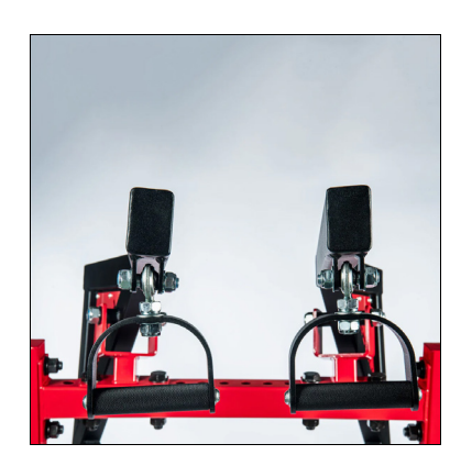
Rotating knurled D handles

At Bench Fitness, we strive to exceed expectations. and our Exceed Plate loaded machines exemplify this philosophy. You can customize the complete range of machines with an extensive range of colors and even add your own branding for a personalized touch. Additionally, all Exceed plate loaded machines are compatible with our REVOLVE band pegs, which can help you take your workouts to the next level.