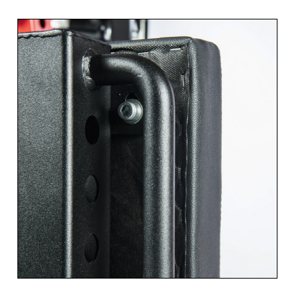
Support grab handles