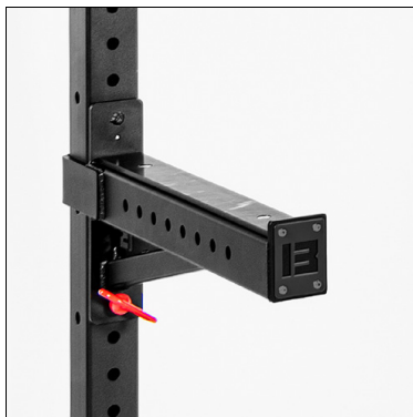
Safety Arm 2.0 included