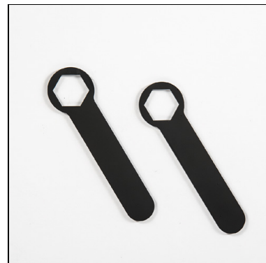
Hardware and tools included for assembly