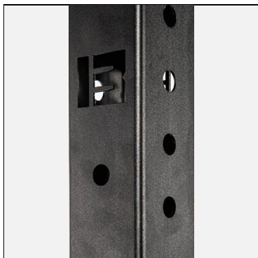
CNC 17mm laser cut holes (50mm hole spacing)

The Core Squat Rack is compatible with the huge range of Bench Fitness attachments turning The Core Squat Rack into a complete training solution.