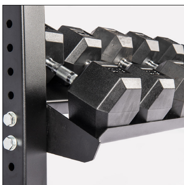
Store hex or round DBs

Built Strong as only Bench Fitness can, the Core 2 Tier Modular Storage rack will take whatever you can throw at it for years to come.