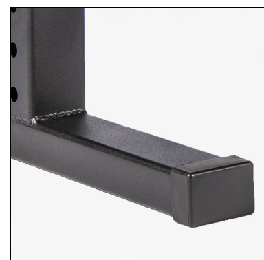
Rubber feet to protect flooring