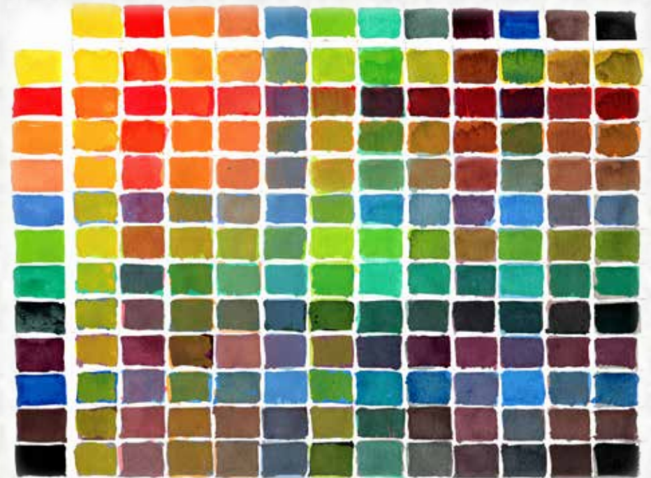
Colour chart created using 12 colours from the Inktense Paint Pan Set.

Across the top and down the left hand side of your chart place pure colours. Then see what can be created by layering one colour over the top of another.