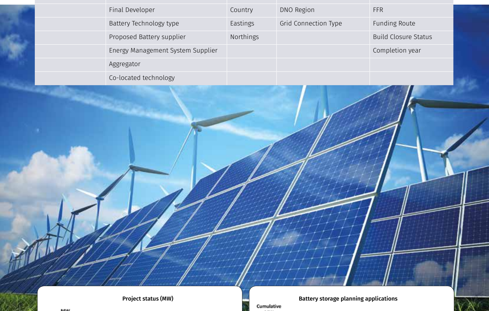
Project status (MW)