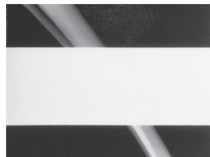
Non-radiolucent abductor bar

OrthoVision’s radiolucent carbon-fiber abductor bars offer unparalleled imaging capability.